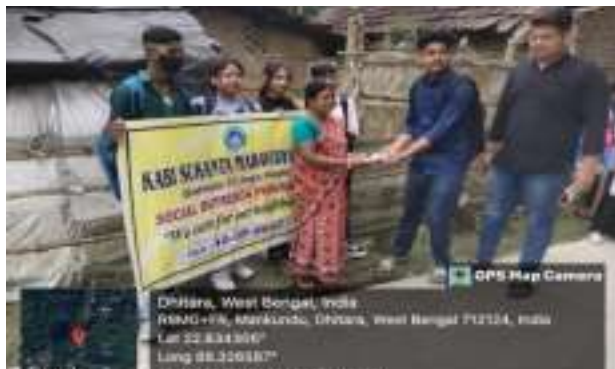
Dhittara, West Bengal, India 88MG+FR, Mankundu, Dhittara, West Bengal 712124, India Lat 22.834387° Long 88.326887°