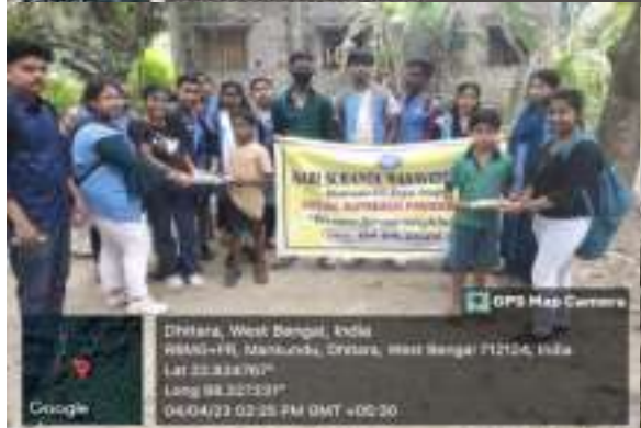
Dhittara, West Bengal, India 88MG+FR, Mankundu, Dhittara, West Bengal 712124, India Lat 22.834767° Long 88.325331° 04/04/23 02:25 PM GMT +05:30