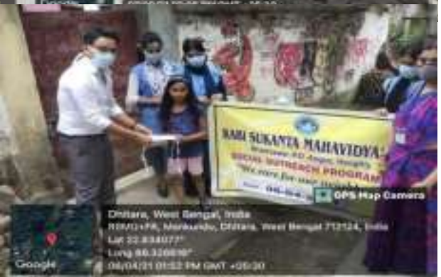
Dhittara, West Bengal, India 88MG+FR, Mankundu, Dhittara, West Bengal 712124, India Lat 22.834077° Long 88.326876° 04/04/23 01:53 PM GMT +05:30