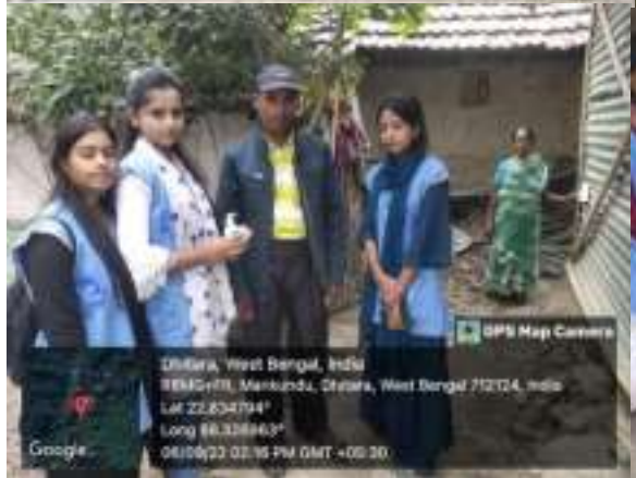
Dhittara, West Bengal, India 88MG+FR, Mankundu, Dhittara, West Bengal 712124, India Lat 22.834794° Long 88.326863° 04/04/23 02:16 PM GMT +05:30